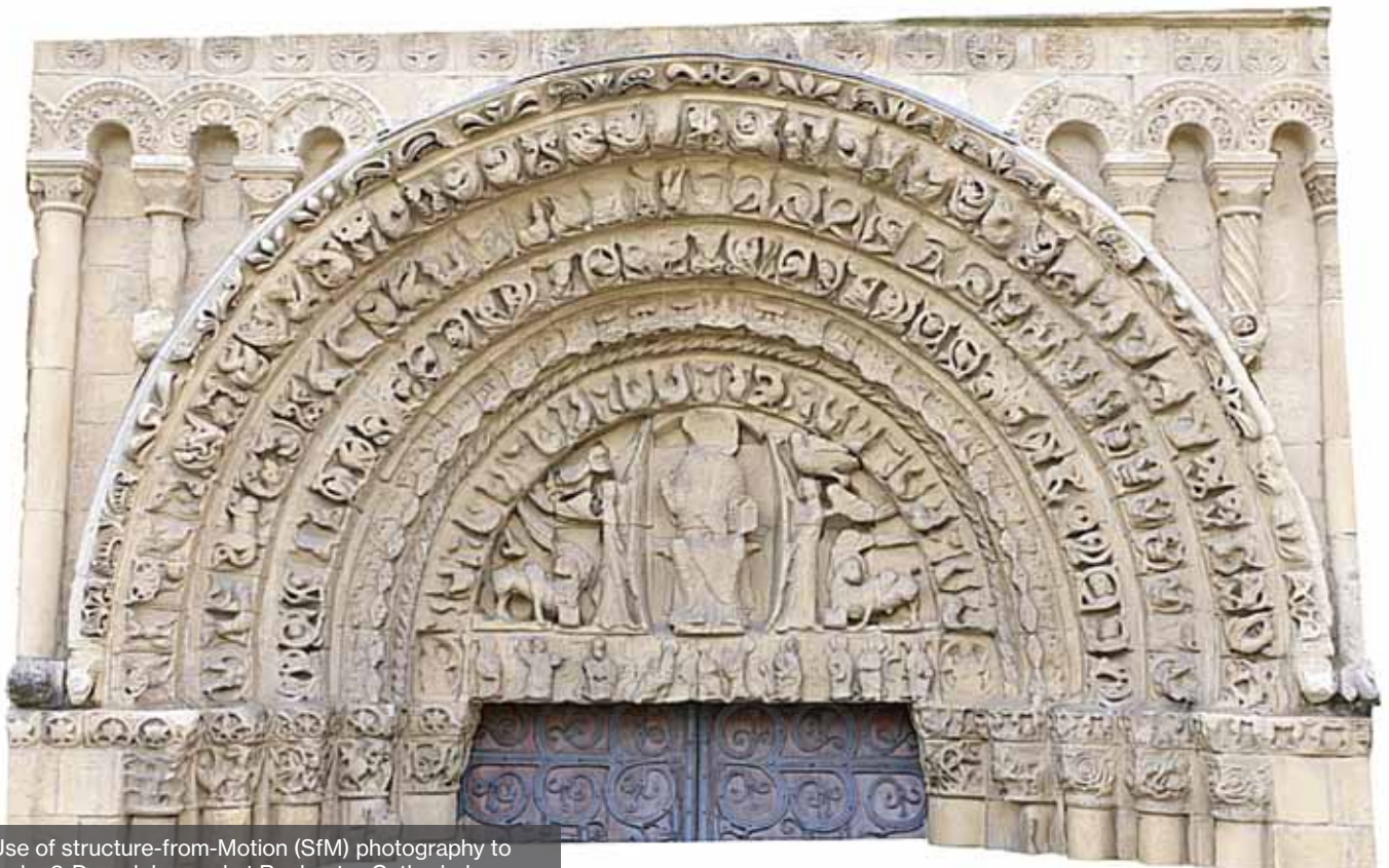
Use of structure-from-Motion (SfM) photography to make 3-D models, used at Rochester Cathedral

The Society relies on its officers and other members giving their time freely to organise activities. Without these contributions, a substantial sum would likely be spent on salaries and additional professional fees.