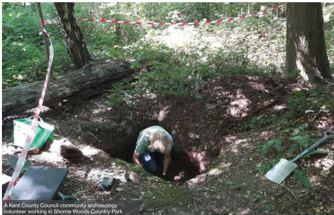
A Kent County Council community archaeology volunteer working in Shorne Woods Country Park

The Membership numbers are keeping reasonably steady. However, some of the shortfalls in the number of ordinary members are due to increasing age and infirmity; some are looking at their financial position because of Covid 19. The new category of Student membership has been introduced to encourage younger people to become interested and continue as members to represent the future. This category is offered at no cost as all publications etc., will be electronic. A decision was taken to encourage any membership category to join online, which has also been a popular move.