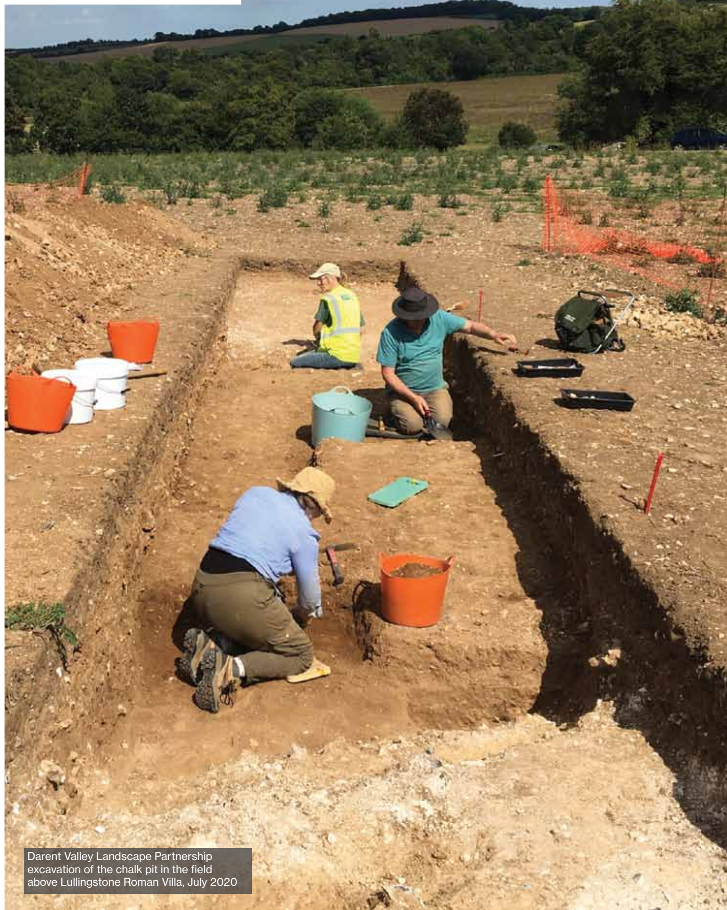
Darent Valley Landscape Partnership excavation of the chalk pit in the field above Lullingstone Roman Villa, July 2020