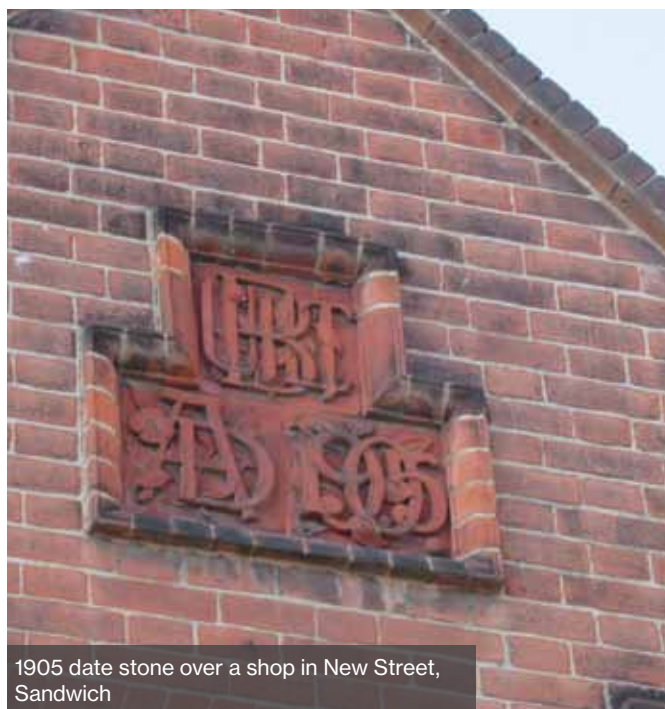
1905 date stone over a shop in New Street, Sandwich

The Society's activities are carried out throughout the ancient county of Kent. It has no staff, and its officers are paid out-of-pocket expenses only. It co-operates with its affiliated societies and the organisations to which it is affiliated or a member. The Council, committees and officers carry out its activities. The Council does not consider it proper for it to be involved in this process beyond advising members of their right of nomination.