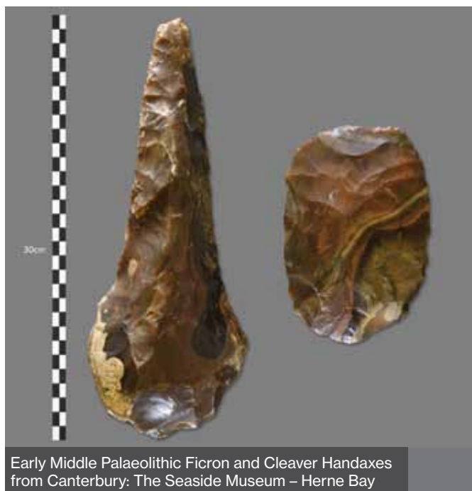
Early Middle Palaeolithic Ficron and Cleaver Handaxes from Canterbury: The Seaside Museum – Herne Bay